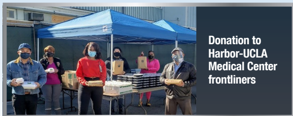
Donation to Harbor-UCLA Medical Center frontliners