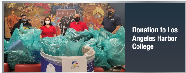
Donation to Los Angeles Harbor College